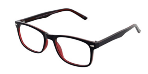
Colour: Black & Blue