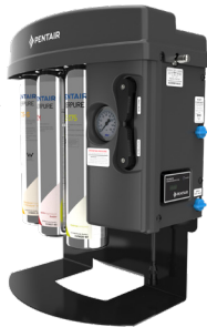
EZ-RO 375/50ATM-BL with optional floor stand bracket