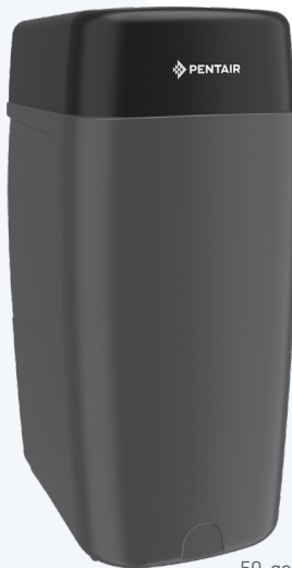
50-gallon atmospheric tank