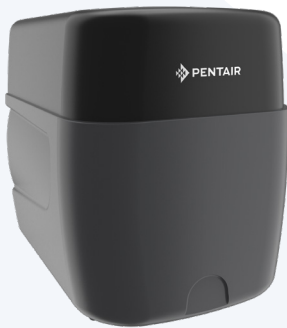
16-gallon atmospheric tank