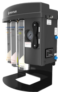
EZ-RO 375/2G-BL with optional floor stand bracket