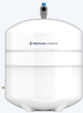
2-gallon hydropneumatic tank