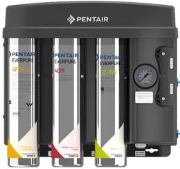
EZ-RO 375/2G wall mount