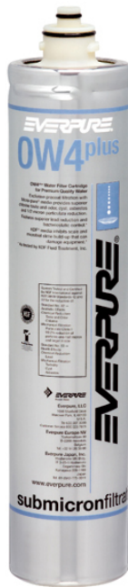
OW4-Plus Replacement Cartridge: EV9635-01

Delivers premium quality drinking water for bottleless coolers and drinking fountains