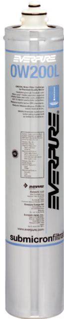
OW200L Replacement Cartridge: EV9619-01

Delivers premium quality drinking water for bottleless coolers and drinking fountains