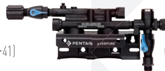
QC71 TWIN HEAD (EV9272-22)