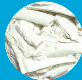
CALCIUM AND MAGNESIUM LIMESCALE DEPOSITS