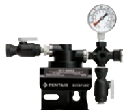
QC71 SINGLE HEAD (EV9272-41)