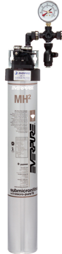
QC71 Filter Head: EV9272-41 MH 2 Cartridge: EV9613-21

Everpure water treatment systems (excluding replaceable elements) are covered by a limited warranty against defects in material and workmanship for a period of five years after date of purchase. Everpure replaceable elements (filter cartridges and water treatment cartridges) are covered by a limited warranty against defects in material and workmanship for a period of one year after date of purchase. See printed warranty for details. Everpure will provide a copy of the warranty upon request.