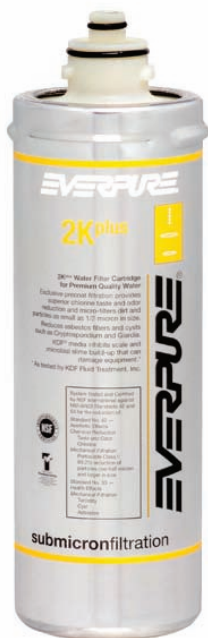
2K-Plus Replacement Cartridge: EV9612-61

Delivers premium quality water for foodservice, vending and OCS applications