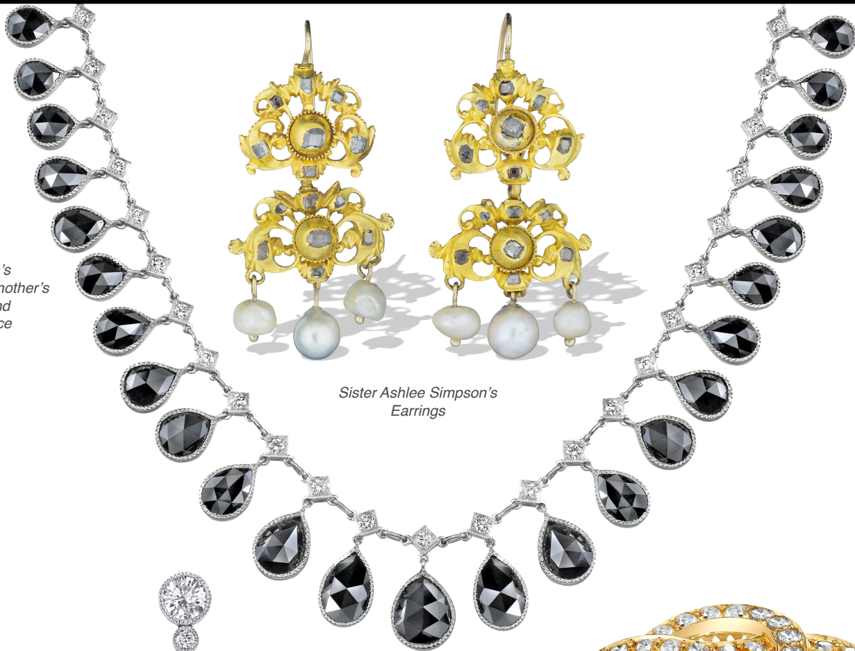
Sister Ashlee Simpson's Earrings