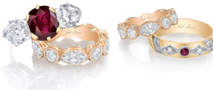
Jessica's earrings, engagement ring and the happy couple's wedding bands

I chose marquise and round cut diamonds for the band, I liked the idea of 4 different cuts; cushion cut ruby, pear, marquise and round cut diamonds. There was a great synergy when the two rings were side by side. We used slight beadwork on the