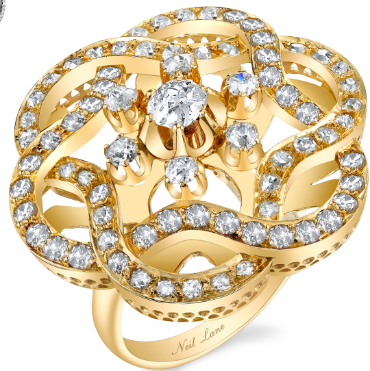
Sister Ashlee Simpson's Ring