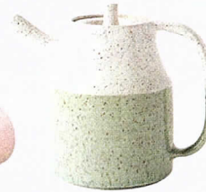
Speckled teapot, $140, dahlhausart.com