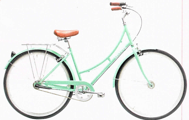
5-speed step-through bike, $789, lochsidecycles.com