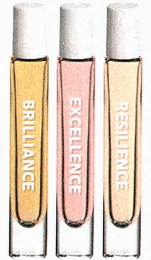
Roll-on perfume oils, $30 each, bailly.co