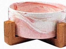
Dog bowl, $48, houseofbarkley.com