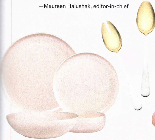
16-piece dinnerware set, $228, serving spoons, $68, fablehome.co