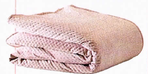
Weighted blanket, $199, indigo.ca

AROMA THERAPY: SAGE/STYLING; CHOW WOW: HOUSE OF BARKLEY; ON A ROLL: BAILLY; PILLOW TALK: ALAMAI; SPILL THE TEA: DAHLHAUSART; HANDS CLEAN: MY PAUME; IN THE CLEAR: COREY MORANIS; TAKE THE CAKE: ATELIER LALOUE; SOAK IT UP: KISMET ESSENTIALS; GET HEAVY: INDIGO