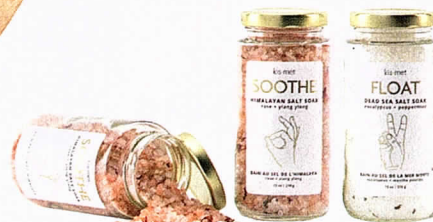
Bath salts, $20 each, kismetessentials.com