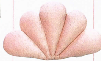
Throw cushion, $82, alamaison.co