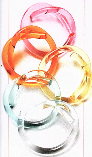
Lucite bangles, $105 each, coreymoranis.com