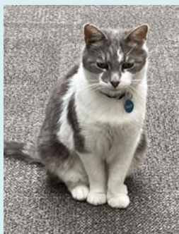
Heath, the Hospice cat.