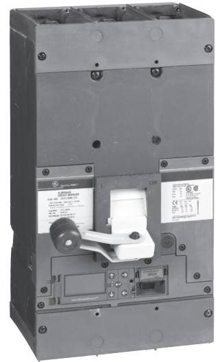
Spectra™ SG600 and SK1200 Breakers with microEntelliGuard™ Trip Units