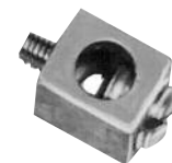
Load Lug THQEL3