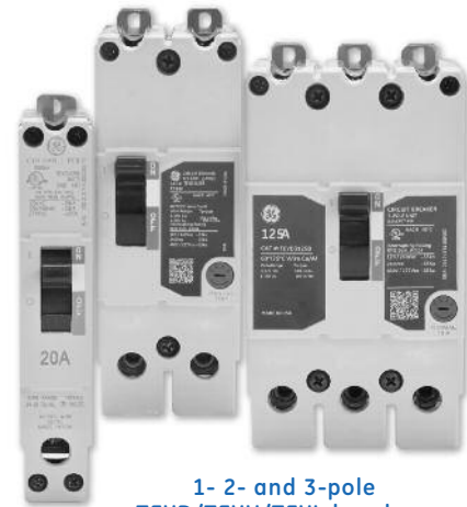
1- 2- and 3-pole TEYD/TEYH/TEYL breakers

The TEY family of circuit breakers (TEY, TEYF, TEYD, TEYH, and TEYL) are one-inch wide per pole, compact, bolt-on circuit breakers for use on grounded 480Y/277 Vac systems, and are typically installed within Lighting Panelboards, including GE A-Series. Short circuit ratings at 480/277 Vac are shown in the tables that follow. Ratings at other voltages are shown in the Quick Reference Guide at the beginning of this section. Bolt-On mounting bases TEY3B (page 6-101) and TEY3B125 (page 6-33) make these frames suitable for unit mount / lug-lug connected applications. Handle tie kits, suitable for use with multiple single pole breakers used on shared neutral circuits (page 6-33) are available for TEYD/H/L circuit breakers.