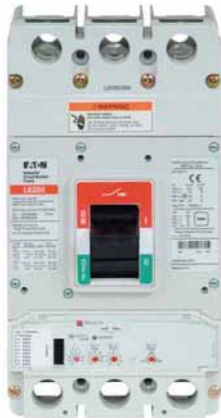
LG-Frame (250–630 Amperes)