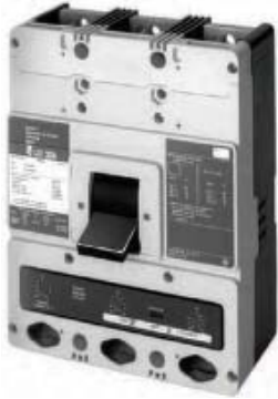
Typical L-Frame Circuit Breaker