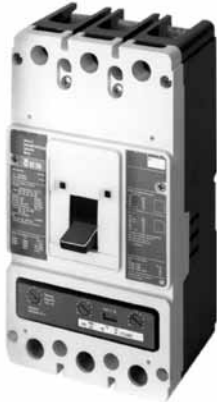
Typical K-Frame Circuit Breaker