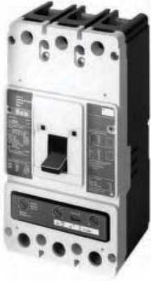
Typical K-Frame Circuit Breaker