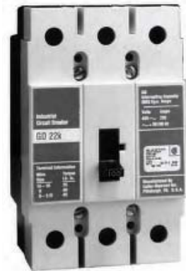
Typical G-Frame Circuit Breaker