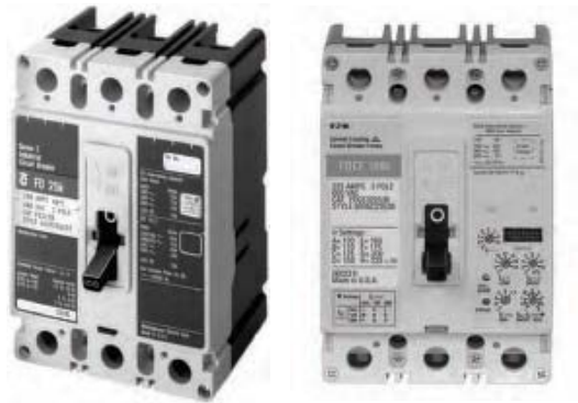
Typical F-Frame Breaker F-Frame Breaker with Electronic Trip Unit