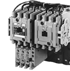
Freedom Series Reversing Starter NEMA Size 1