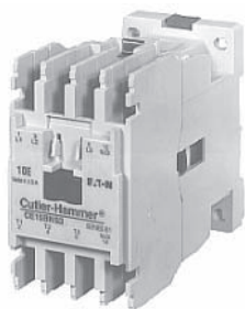
IEC Size B Cat. No. CE15BNS3AB

Note: For more information, see CA03402001E.