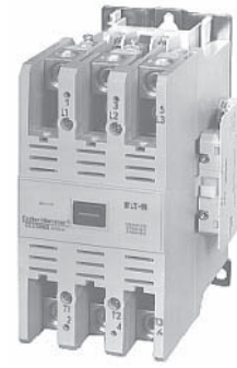
IEC Size N Cat. No. CE15NN3A