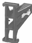
Part No. 23-7165