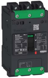
B-Frame Thermal-Magnetic Trip Unit