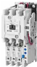
Size 1 Reversing Starter