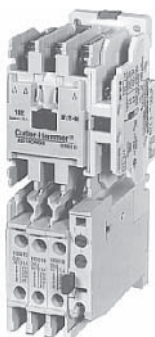
IEC Size D Cat. No. AE16DN0BC

Note: For more information, see CA03402001E.