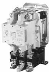
Size 3 Starter

Enter heaters as separate item by listing catalog number from the tables on Pages V5-T2-139 and V5-T2-140 , as required per starter.