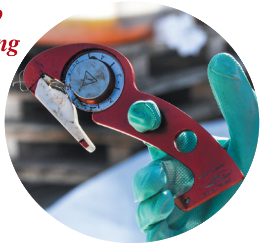
Oil recovery at Tjörn 2011*

S-CUT is an optimal tool when it comes to quickly removing clothing to start lifesaving measures. Compared with scissors and knives, the S-CUTs considerably shorten the time for cutting clothes in trauma situations, cardiac arrests, chemical accidents and hypothermia.