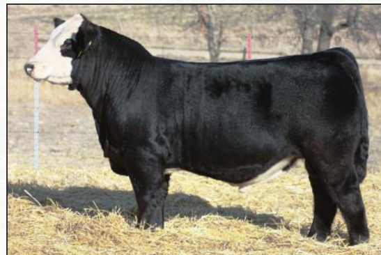
W/C Loaded Up 1119Y Purebred Simmental sire of Lots 278-301

The Loaded Up females have far exceeded our expectations. The two- and three-year-olds we have retained are some of the prettiest uddered, biggest bodied cows in their pastures. They have raised some exciting calves that you will hear from next year! They are perfect for today's industry. Moderate milking machines that transmit power and shape into their calves. We are excited to see what they will produce with our new lineup of Simmental herd sires.