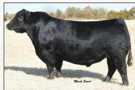
GCC Gold Standard X615 Purebred Angus sire of Lot 349...his AI service sells