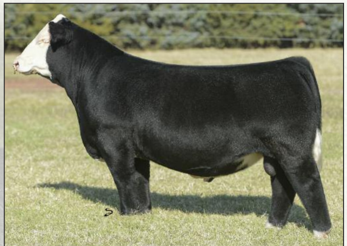
Conley GCC Shocker C19 3/4 Simmental sire of Lots 235-237