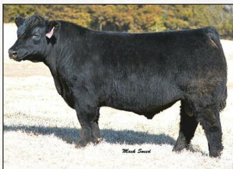
GCC Double Good 521A 1/4 Maine sire of Lot 202

A beautiful Double Good female that patterns up with looks to kill. Slick fronted and big hipped with boldness through that center body cavity. Perfect structured with balance from end to end.