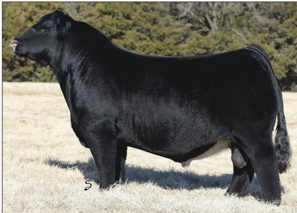
GEFF County O

A 3/4-blood out of a Steel Force cow—now, that is something to build around! A long, extended heifer that has the punch and width to hold her own anywhere!