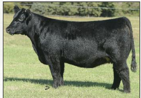
GCC Blackbird A604 Dam of Lot 175 ...sold in the 2015 Classic

Okay, here is what the Classic sale has been able to do. The mother to 400G was a former Lot 101 that Jones Show Cattle purchased half interest in. Her progeny sales will soon reach six figures. She has put show heifers and bred heifers in the Classic and herd bulls in our Denver pen that have been high sellers in the bull sale. She is a can't-miss type of female. 400G sold as a show baby in last year's Classic and was purchased by our good friend Kim Klotz as a way to ramp up his purebred Maine herd. 400G will be able to redefine any program. Stout, capacious and awesome structured. Here lies your opportunity to invest in a female with power in the background and bright lights in the future!