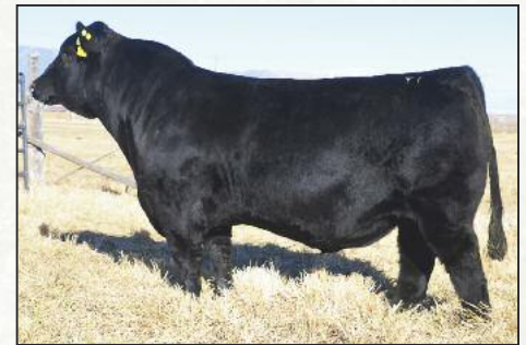
THSF Lover Boy B33 Calving ease purebred Simmental AI sire

AI 5/3 LOVER BOY / LIKELY SAFE AI / 7.5 MONTHS