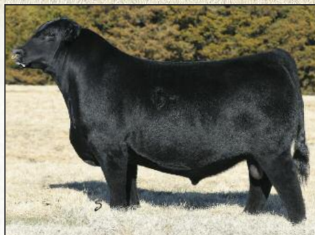
GCC Money Earned 852E ET

We start off our Angus bred heifer division with a female we think is extraordinary. A Money Earned daughter out of the great 606C donor cow. This heifer's granddam is the one and only Juanada 927K. Study the lines, the boldness of rib, the squareness of hip and add that together with the pedigree. This one can be a lead off donor for any program in the nation. With Money Earned's added growth and power and the maternal predictability of the bottom side of this heifer's pedigree, it's hard to find a flaw in this female any way you look at it.