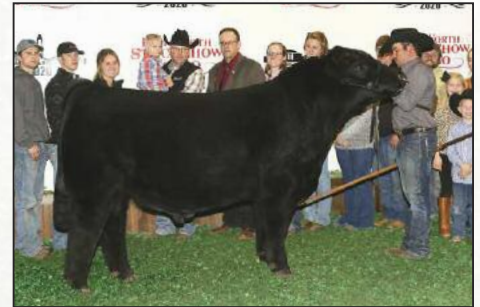
CCMM Full Tilt 803F 3/4 Maine calving ease herd sire, owned with Copeland & Sons

AI 5/3 FULL TILT / LIKELY SAFE AI / 7.5 MONTHS