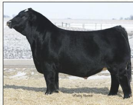
GSC GCCO Dew North 102C Purebred Simmental sire of Lots 238-242

AI 3/29 FULL TILT / LIKELY SAFE AI / 8.5 MONTHS