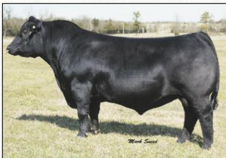
Duff Angus 011 Maternal grandsire of Lot 291