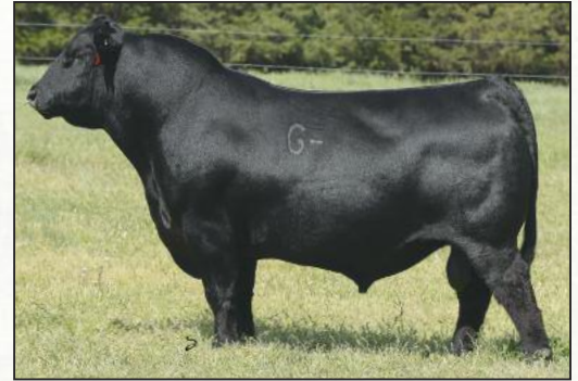
GCC New Game 5654C Sire of Lots 366-384