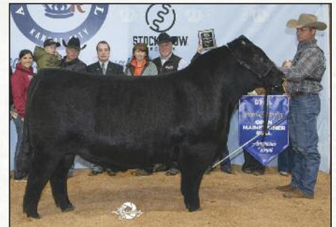
GCC Masterpiece 421G ET Maternal brother to Lots 128 and 129... 2020 American Royal Grand Champion MaineTainer Bull

AI 4/30 FULL TILT / LIKELY SAFE AI / 8 MONTHS