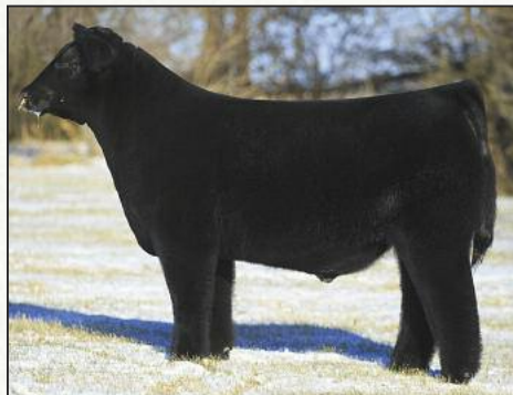
NMR New Beginning ET 1/2 Maine sire of Lots 193 and 194