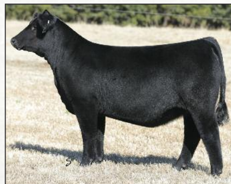
GCC Price of Love 103G Maternal sister to Lot 240 ...sold as Lot 30 in the 2019 Classic

Here is a purebred out of the Macho daughter U311, who was a past champion in Kansas City. Two half sibs by Pay the Price sold in the Classic last year as open show heifers, one of which was named Champion Simmental at the Nebraska State Fair this year. U311 is now deceased, so this Dew North daughter will be one of the last. This heifer is the kind to take a purebred program to the next level.