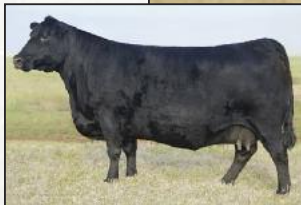
927K — pictured at age 14

Wow! What a pedigree. A New Game over an own daughter of 927K, this female has quickly risen to the top of her contemporaries in terms of look, power and substance. Some cattle just have that "it" factor, and Lot 367 does. Couple all this with her maternal predictability, and you have a secure base to build off of.