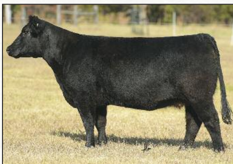
GCC Ms Money 6512DET Dam of Lot 325...she sells as Lot 514

AI 5/19 LOVER BOY / LIKELY SAFE AI / 7 MONTHS