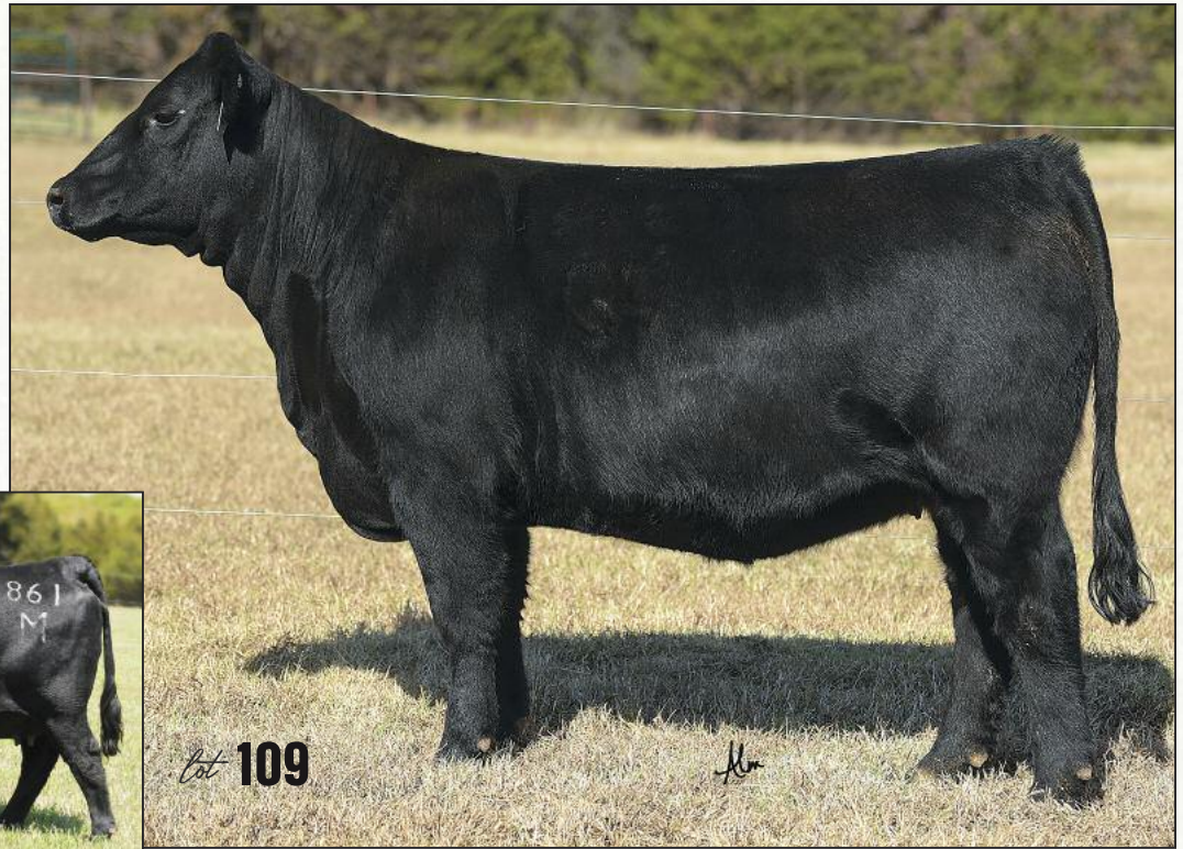
OCC Dixie Erica 861M Maternal granddam of Lot 109