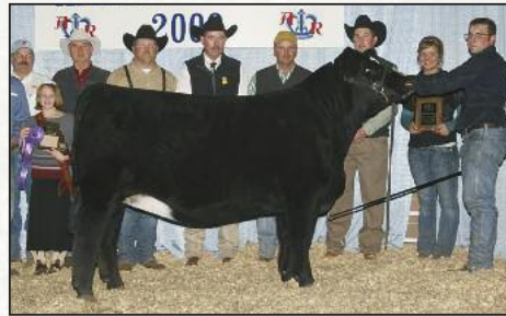
ETR/SS Gotta LoveMe U311 Dam of Lot 251