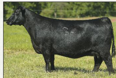
GCC Juanada 911D ET Daughter of Class Time

AI 5/3 LEGACY / LIKELY SAFE AI / 7.5 MONTHS PE 5/8-10/3 673D