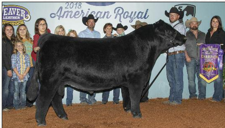
ETR Blitz 208E Sire of Lots 337-342 His dam sells as Lot 540