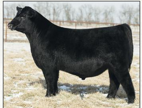
PVF The Natural 7042 Sire of Lots 353 and 354

Here is a daughter of Jody W911 that goes back to the great "066" Griswold cow family. The Jody 066 family is the most predictable and time-tested cow family here at the G-. With the genetics of the 066 family combined with the power and look provided by The Natural, this heifer has it in her to be a foundation brood cow or donor candidate on down the road.