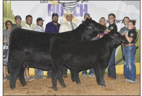
GCC Miss Boston 5501C2 Full sister to Lots 144-146... many-time champion and high seller in the 2019 Classic