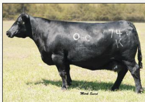
OCC Juanada 741K Dam of GCC Total Recall and third dam of Lot 133