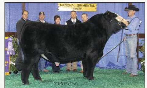
MR HOC Broker

Purebred Simmental sire or grandsire of Lots 243-250