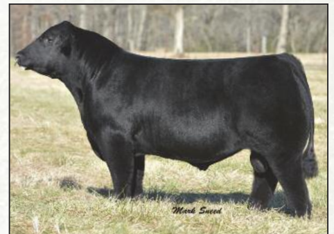
Daddys Money 55Z