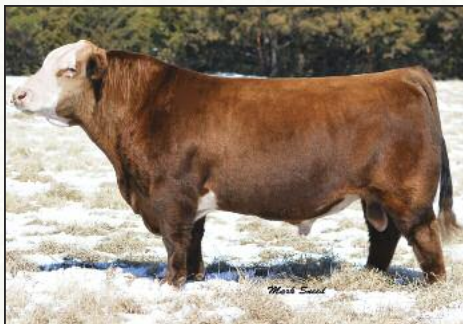
Houston X01 Sire of Lots 323 and 324