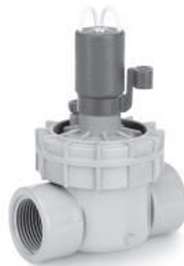
Solid construction, reliable performance, convenient operation.