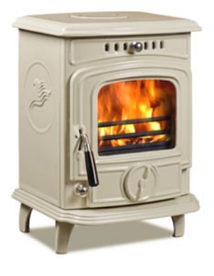
Pewter High Gloss Enamel