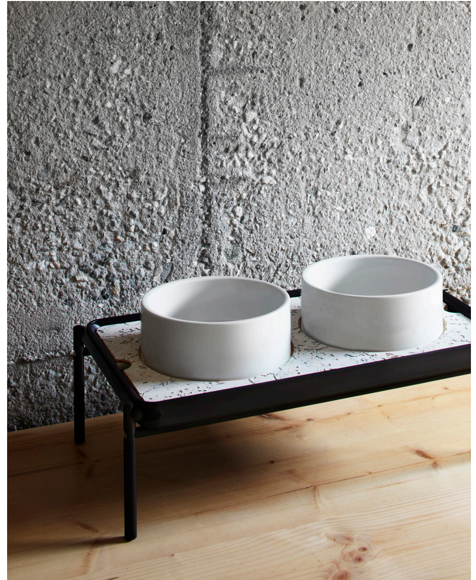
NAPFSTÄNDER, Black Anodized Aluminum with a White Marble Cork Insert