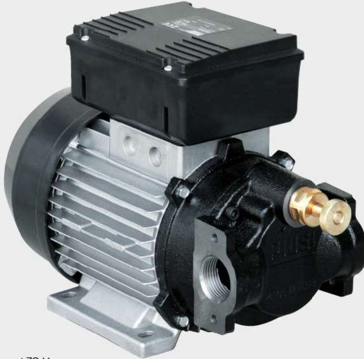
Viscomat 70 M