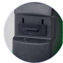
'On' and 'Off' Switch