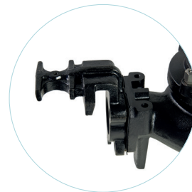
Flygt guide hook adaptor (optional extra)