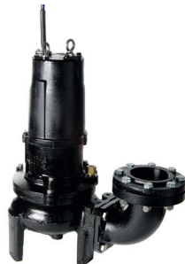
100UZ43.7 free-standing (elbow is an optional extra)