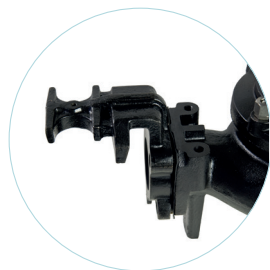
Flygt guide hook adaptor (optional extra)