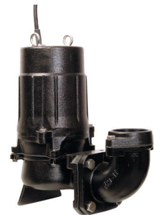
80U21.5 free-standing (elbow is an optional extra)