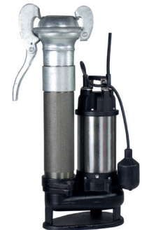
Lever lock kit