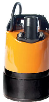
LSC1.4S 50mm outlet