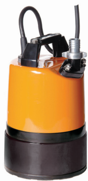
LSC1.4S 25mm outlet