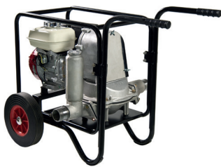
TD200 with trolley