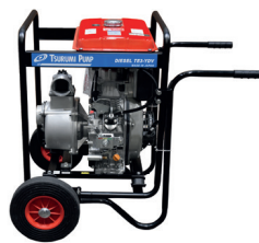
TE3-YDV with trolley