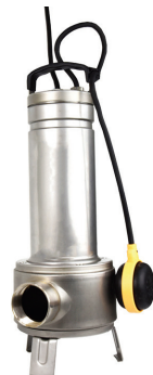
SXS 1000 auto