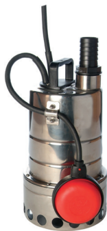
Mizar VOX auto