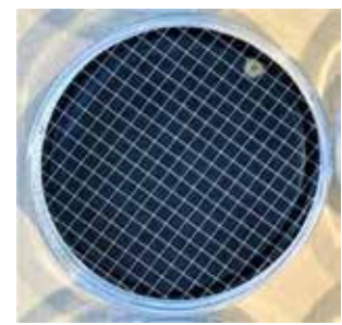
After (example of 5 log reduction)