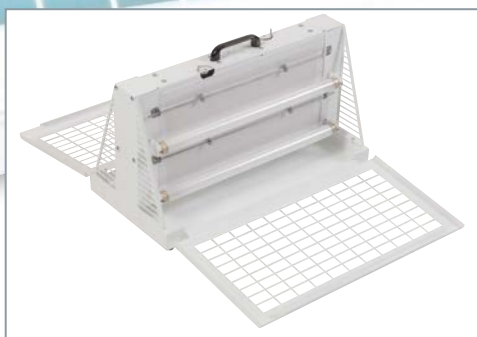
360° of light emission