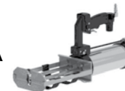
One tool, dual grip configurations