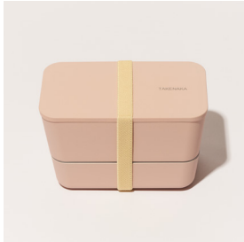
Matte Candy Pink ▶ 2023 NEW 12-1805-67