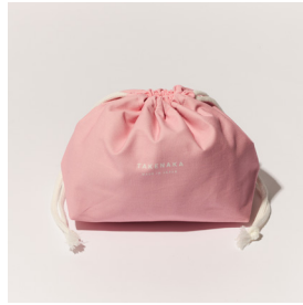
Insulated Bento Bag ▶ 2023 NEW Matte Candy Pink 12-4701-64