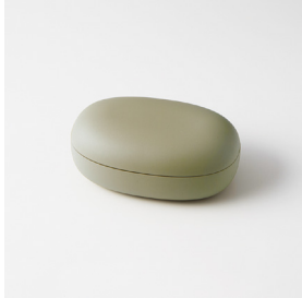
Bamboo Green 12-1804-67