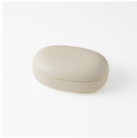
White Eggshell 12-1804-07