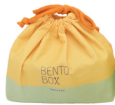
Bento Box Bag Lemon + Pistachio 12-4302-54

Size: 11.8" W x 3.9" D x 7.5" H / W29.9cm x D9.9cm x H19cm