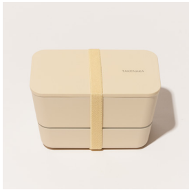
White Eggshell ▶ 2023 NEW 12-1805-07