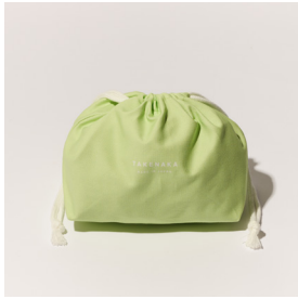
Insulated Bento Bag ▶ 2023 NEW Lime Cream 12-4701-042