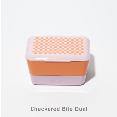
Checkedred Bite Dual