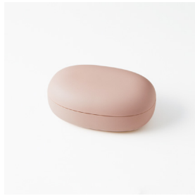
Matte Candy Pink 12-1804-041