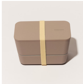
Gray Stone ▶ 2023 NEW 12-1805-84