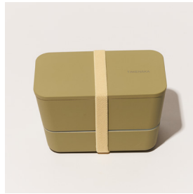
Bamboo Green ▶ 2023 NEW 12-1805-041