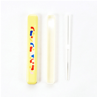
CHOPSTICKS with CASE in Elements

Material: Body, Top Lid: 100% recycled PET bottles Partition, Inner Lid, Fork: Polyethylene