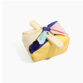
BENTO Wrapping Cloth FUROSHIKI