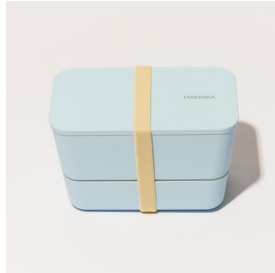
Ocean Breeze ▶ 2023 NEW 12-1805-34