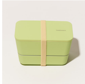
Lime Cream ▶ 2023 NEW 12-1805-042

We are always making strides to support a better planet. This year we launched BIO - a plant-based, sustainable plastic series. This bento features a two-tiered, minimalistic look for more space to take your meals to go.