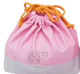
Bento Box Bag Pink + Gray 12-4302-63