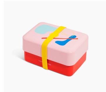
BENTO BOX in POOL

Size: 6.5"W x 4.3"D x 3.5"H / W16.5cm x D10.9cm x H8.9cm