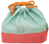
Bento Box Bag Mint + Tangerine Orange 12-4302-45

Discriptions: Insulated lining lightweight lunch bag w/ drawstring closure. Hand wash only.