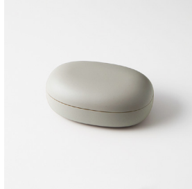
Gray Stone 12-1804-84

Our Pebble is the perfect size for snacks with an airtight lid and removable divider. Carry your fruits, nuts, crackers and more in this sustainable bento.