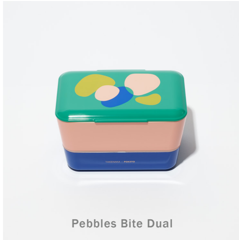
Pebbles Bite Dual