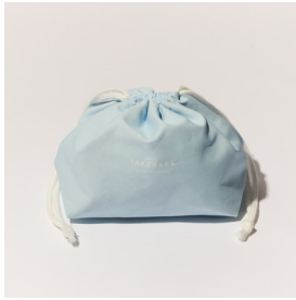
Insulated Bento Bag ▶ 2023 NEW Ocean Breeze 12-4701-34