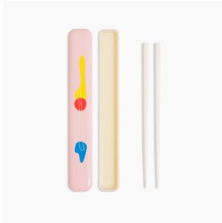
CHOPSTICKS with CASE in Pool

Material: Chopsticks: Acrylic Resin, Case: ABS, Handwash only