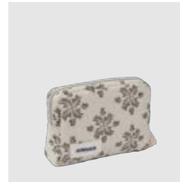
SKU 585 COSMETIC BAG QUILTED ORGANIC COTTON, EVERGREEN 17 X 12 X 5 CM