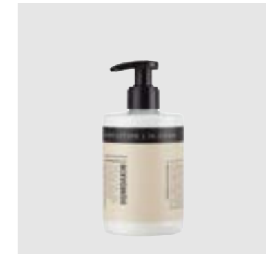
SKU 2 HAND LOTION 01 CHAMOMILE & SEA BUCKTHORN 300 ML

HUMDAKIN HAS SPENT FIVE YEARS DEVELOPING THE PERFECT HAND CARE PRODUCTS THAT LEAVES YOUR SKIN SOFT AND MOISTURIZED. INSPIRED BY THE SCENTS OF SCANDINAVIAN NATURE, WE HAVE SELECTED A RANGE OF NURTURING AND CARING INGREDIENTS.