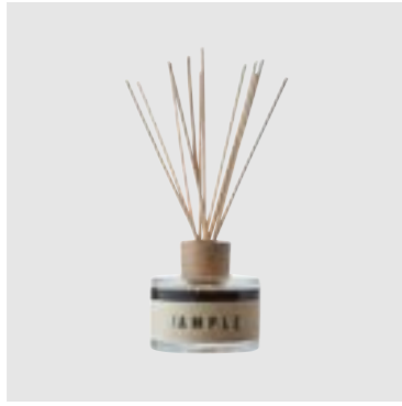
SKU 69 FRAGRANCE STICKS AMPLE 250 ML