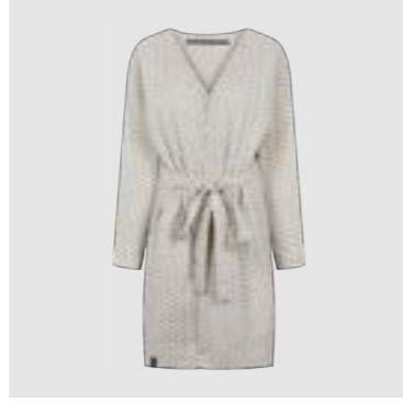
SKU 563 HOTEL ROBE QUILTED ORGANIC COTTON, OCEAN S/M, M/L