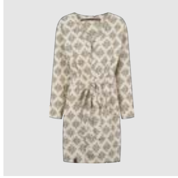
SKU 563 HOTEL ROBE QUILTED ORGANIC COTTON, EVERGREEN S/M, M/L