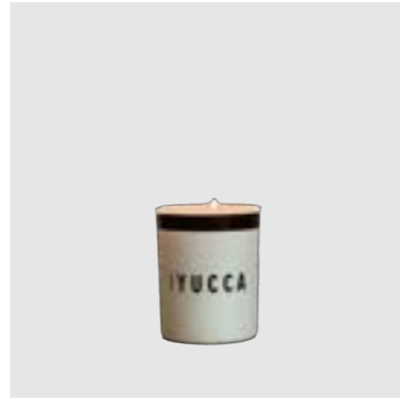
SKU 197 SCENTED CANDLE YUCCA 210 G

THE FRAGRANCE STICKS DIFFUSE A DELICATE AND CLEAN SCENT THAT FEELS SAFE, WARM AND COZY, LEAVING A COMFORTING AND WELCOMING ATMOSPHERE. PROLONG THE LIFE OF YOUR FRAGRANCE STICKS IN THE GLASS BOTTLE BY REFILLING THE OIL AND STICKS WITH OUR REFILLS. IF YOU WANT AN EVEN MORE CLEAN AND COZY ATMOSPHERE, LIGHT UP A SCENTED CANDLE MADE FROM 100% RAPSEED WAX.