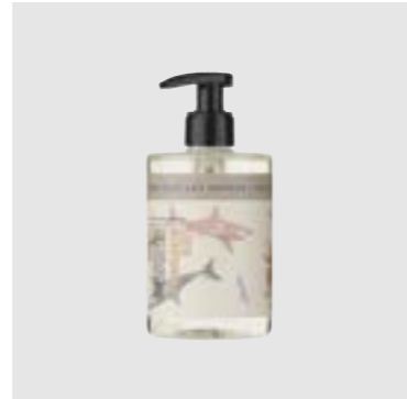
SKU 266 KIDS SOAP & SHOWER WILD ANIMALS PRINT HONEY & MINT 300 ML - 3 IN 1