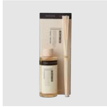
SKU 187 SCENT REFILL IVORY 250 ML