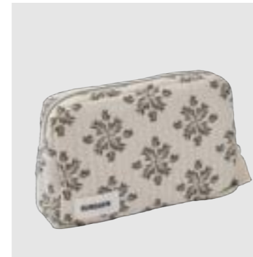
SKU 584 TOILETRY BAG QUILTED ORGANIC COTTON, EVERGREEN 22 X 14 X 7 CM