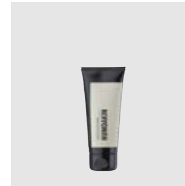
SKU 68 HAND LOTION 01 CHAMOMILE & SEA BUCKTHORN 60 ML