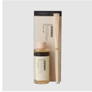
SKU 564 SCENT REFILL VIPAKA 250 ML