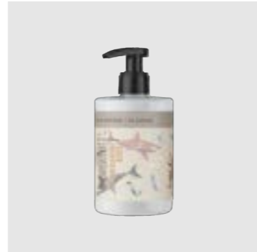
SKU 385 KIDS LOTION HONEY & MINT 300 ML