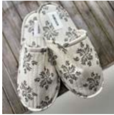
SKU 562 HOTEL SLIPPERS QUILTED ORGANIC COTTON, EVERGREEN S/M, M/L