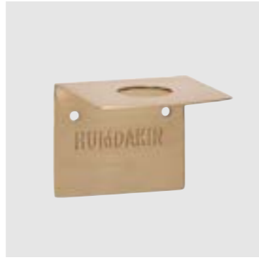
SKU 305 BOTTLE HANGER BRASS, MATTE FINISH 6 X 6 X 5 CM - SINGLE