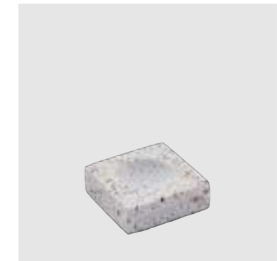
SKU 550 EGG TRAY SINGLE TERRAZZO, RED/BEIGE 6 X 6 X 20 CM