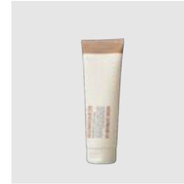
SKU 469 INTIMATE WASH PERFUME FREE w. CHAMOMILLE EXTRACT 250 ML