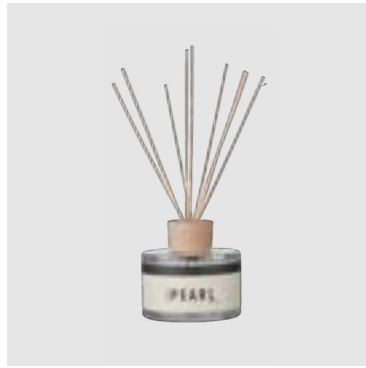
SKU 569 FRAGRANCE STICKS PEARL 250 ML