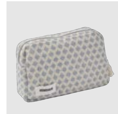
SKU 584 TOILETRY BAG QUILTED ORGANIC COTTON, OCEAN 22 X 14 X 7 CM