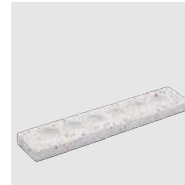
SKU 512 EGG TRAY TERRAZZO, RED/BEIGE 32 X 6,5 X 2 CM