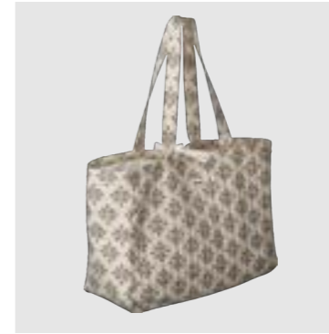
SKU 560 MAXI TOTE BAG QUILTED ORGANIC COTTON, EVERGREEN 54 X 41 X 22 CM