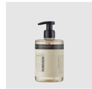
SKU 1 HAND SOAP 01 CHAMOMILE & SEA BUCKTHORN 300 ML