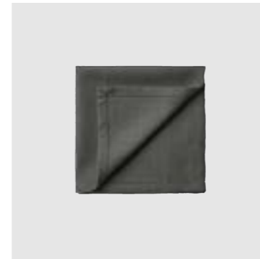
SKU 237 NAPKINS - 2 PCS GREEN SEAWEED 40 X 40 CM