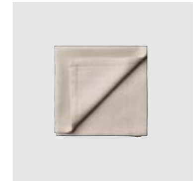
SKU 237 NAPKINS - 2 PCS LIGHT STONE 40 X 40 CM

FOR THE COMPLETE HUMDAKIN COLLECTION, HAVE A LOOK AT OUR BRAND CATALOG