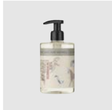
SKU 266 KIDS SOAP & SHOWER FAIRYTALE PRINT HONEY & MINT 300 ML - 3 IN 1