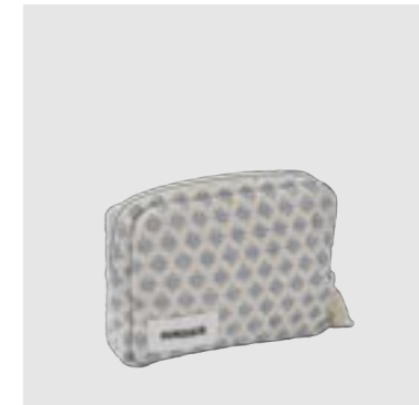
SKU 585 COSMETIC BAG QUILTED ORGANIC COTTON, OCEAN 17 X 12 X 5 CM