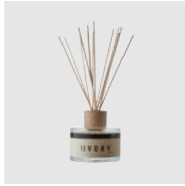
SKU 70 FRAGRANCE STICKS IVORY 250 ML