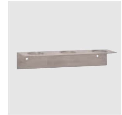
SKU 310 BOTTLE HANGER STEEL, BRUSHED POLISH 20 X 6 X 3,5 - TRIPLE