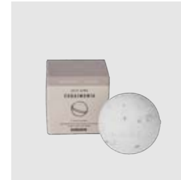
SKU 458 BATH BOMB PEONY 125 G