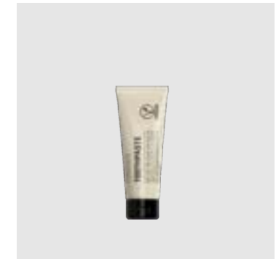
SKU 390 TOOTH PASTE VEGAN 75 ML