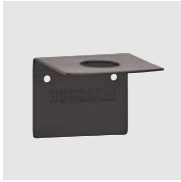
SKU 302 BOTTLE HANGER IRON, BLACK EPOXY 6 X 6 X 5 CM - SINGLE