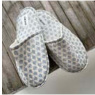
SKU 562 HOTEL SLIPPERS QUILTED ORGANIC COTTON, OCEAN S/M, M/L

WITH ACCESSORIES IN BEAUTIFUL AND SUMMERY COLORS AND PATTERNS, HUMDAKIN INSPIRES TO SELF-CARE AND RE-LAXATION AT YOUR HOTEL STAY. OUR TEXTILES ARE MADE FROM 100% GOTS CERTIFIED ORGANIC COTTON.