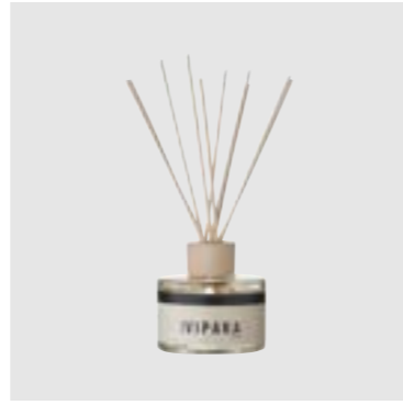
SKU 386 FRAGRANCE STICKS VIPAKA 250 ML