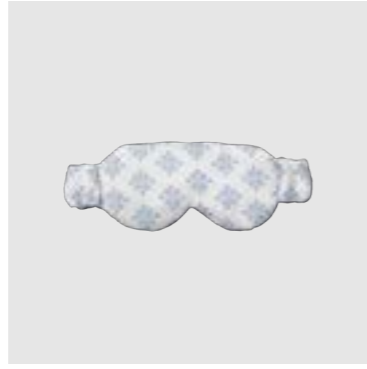
SKU 561 SLEEPING MASK SATIN, OCEAN