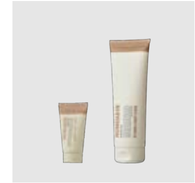
SKU 646 HAND & BODY SCRUB 30 ML SKU 285 250 ML MATCHA TEA