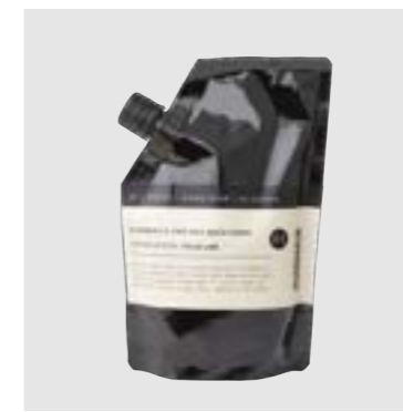
SKU 264 HAND SOAP - REFILL 01 CHAMOMILE & SEA BUCKTHORN 750 ML