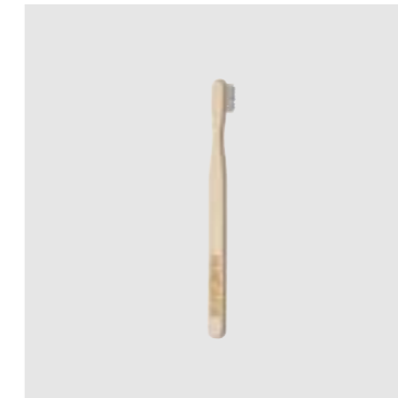
SKU 398 TOOTHBRUSH ORGANIC BAMBOO WOOD