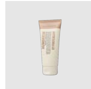
SKU 583 FOOT CREAM MENTHOL & COCOA BUTTER 100 ML