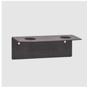
SKU 303 BOTTLE HANGER IRON, BLACK EPOXY 14 X 6 X 5 CM - DOUBLE