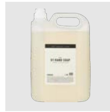
SKU 614 HAND SOAP - REFILL 01 CHAMOMILE & SEA BUCKTHORN 5000 ML