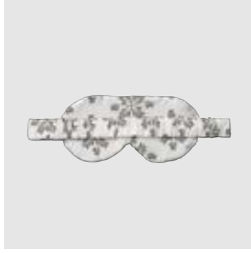
SKU 561 SLEEPING MASK SATIN, EVERGREEN