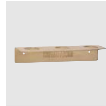
SKU 309 BOTTLE HANGER BRASS, MATTE FINISH 20 X 6 X 3,5 - TRIPLE