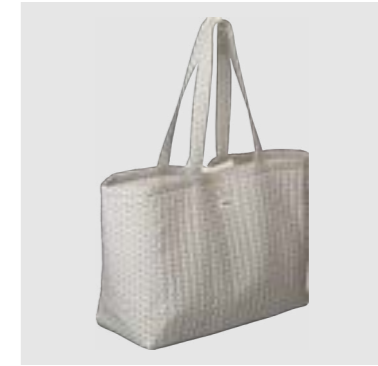
SKU 560 MAXI TOTE BAG QUILTED ORGANIC COTTON, OCEAN 54 X 41 X 22 CM