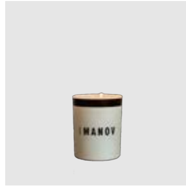
SKU 196 SCENTED CANDLE MANOV 210 G