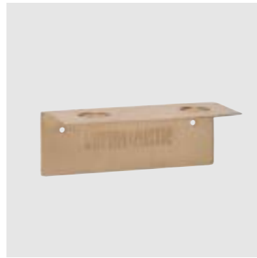
SKU 307 BOTTLE HANGER BRASS, MATTE FINISH 14 X 6 X 5 CM - DOUBLE