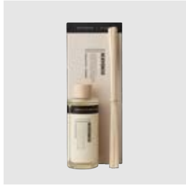
SKU 186 SCENT REFILL AMPLE 250 ML