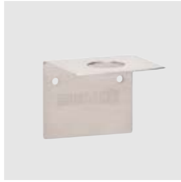
SKU 306 BOTTLE HANGER STEEL, BRUSHED POLISH 6 X 6 X 5 CM - SINGLE