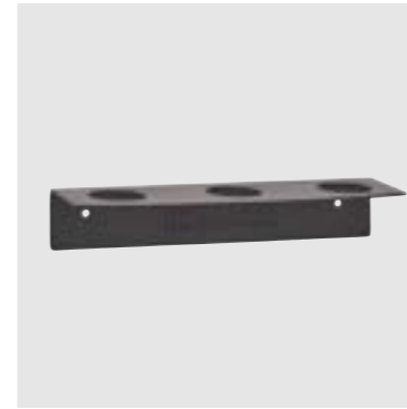
SKU 304 BOTTLE HANGER IRON, BLACK EPOXY 20 X 6 X 3,5 - TRIPLE