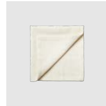
SKU 237 NAPKINS - 2 PCS SHELL 40 X 40 CM