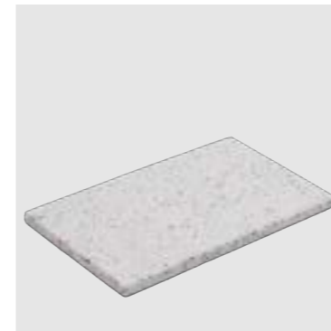
SKU 510 BOARD w. GROVES TERRAZZO, RED/BEIGE 25 X 15 X 1,5 CM