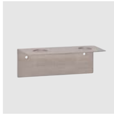
SKU 308 BOTTLE HANGER STEEL, BRUSHED POLISH 14 X 6 X 5 CM - DOUBLE