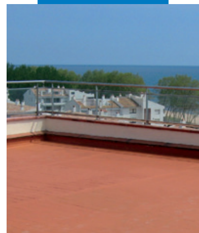
Paving slab waterproofed with Aquaflex Roof