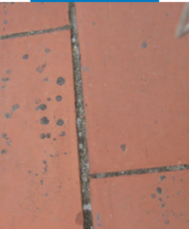
An example of old terracotta floor requiring treatment before applying Aquaflex Roof