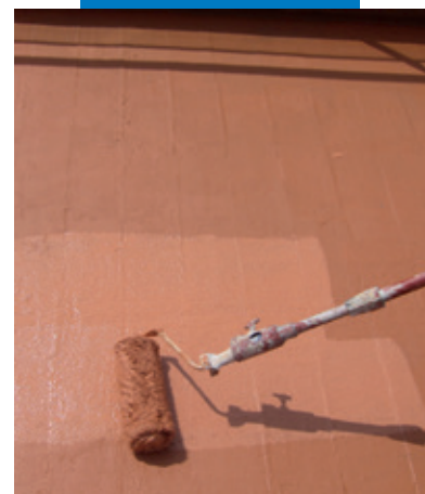
Application of Aquaflex Roof with a long-piled roller