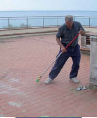
Cleaning a substrate before applying Aquaflex Roof